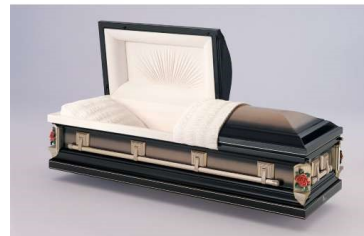
Golden Midnight $8,055.00 taxes included