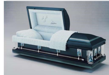
Antique Blue $7,480.00 taxes included