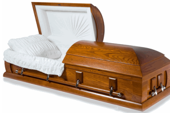
Wood $5,800.00 taxes included