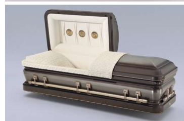
Golden Granite 8,460.00 taxes included