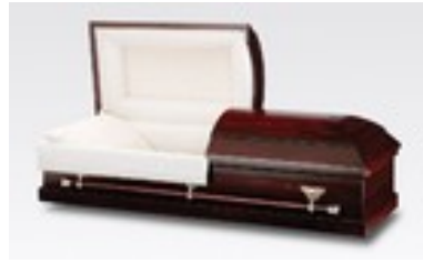
Gurnet Hardwood $6,720.00 taxes included