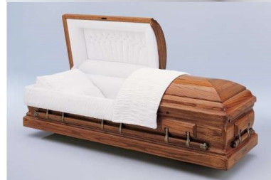
Bexley Oak $8,800.00 taxes included