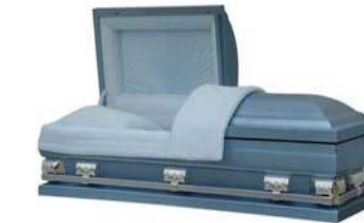
Churchill Blue $6,900.00 taxes included