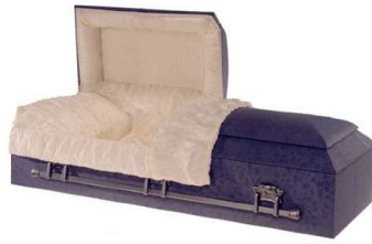
Grey Cloth $5,420.00 taxes included

TO SEE COMPLETE SELECTION GO TO WWW.SERENITYLINDSAYFUNERALHOME.CA