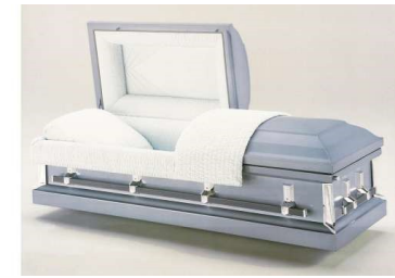
20g Metal Sealer $5,950.00 taxes included