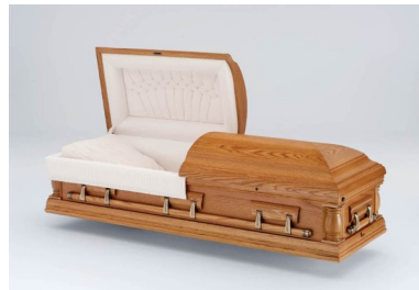
Cameron Oak Hardwood $7210.00 taxes included