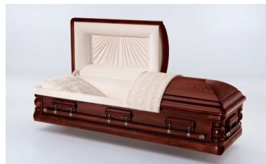
Prominence $7,750.00 taxes included