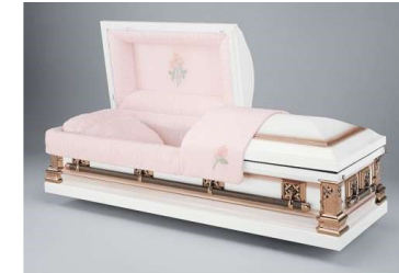
Primrose $6,930.00 taxes included